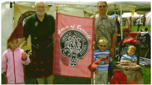
Son and grandchildren of the Secretary of the HOB At the Wisconsin Highland Games