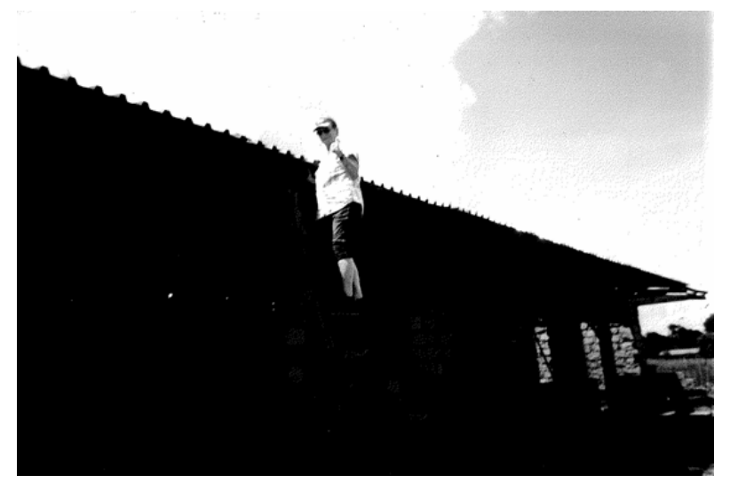
Repairing the school roof in Kenya